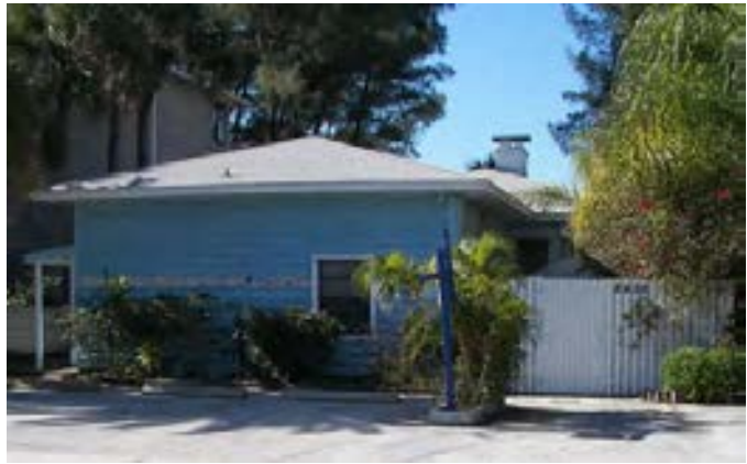
8430 West Gulf Blvd. Now and 8430 West Gulf Blvd. Then

It's begining to seem a lot like Canada But I've devised a plan Instead of our playing host To all of the northernmost Sunset Beachers- head their way It couldn't be much worse there, eh?